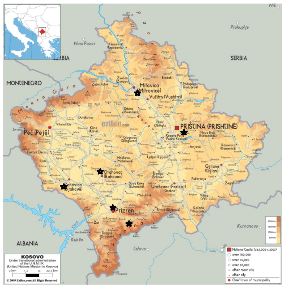
Figure 1. Research area (Kosovo) and stations of honey samples that were obtained (https://www.ezilon.com/maps/europe/kosovo-physical-maps.html)