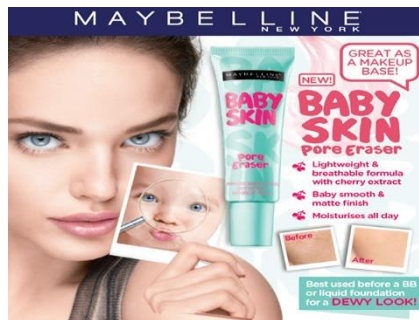
Fig.7. The “expressive-emotional”advertisement