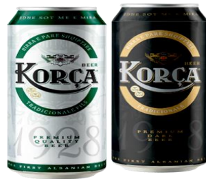
Fig.6. The "Poetic" advertising