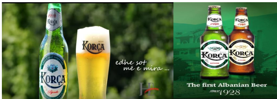
Fig.3. The "Referential advertising "