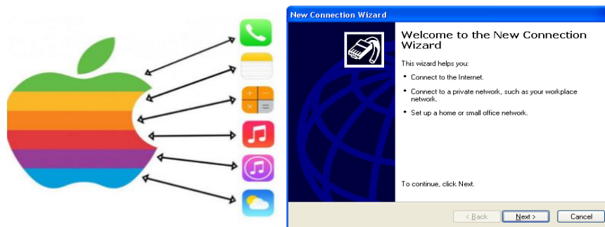
Fig.4-5. The "Meta-language" advertising