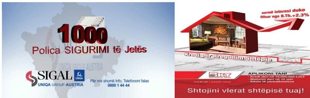
Fig. 8-9. The "Conative" advertising