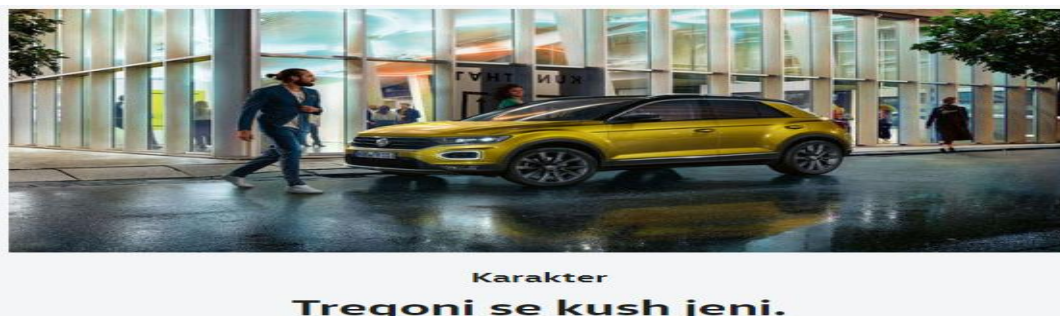
Fig.10. The "phatic" advertising