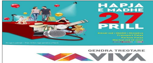
Fig.1. Denotation and connotation of advertising