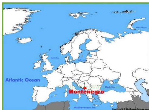
Image 2. Montenegro location

Source: http://ontheworldmap.com/montenegro/montenegro-location-on-the-europe-map.html