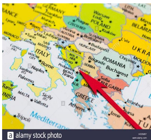
Image 1. Montenegro location